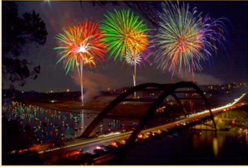
Fireworks Over the Pennybacker Bridge