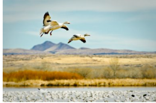
Snow Geese Landing Beverly McCranie