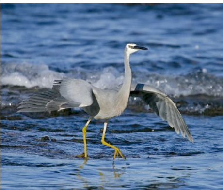
White-faced Heron