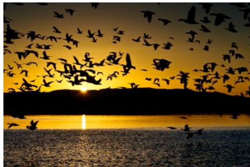
Lift Off Dolph McCranie