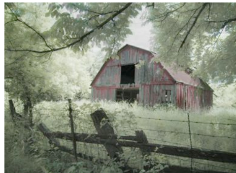
Old Barn in Soft Light Rose Epps