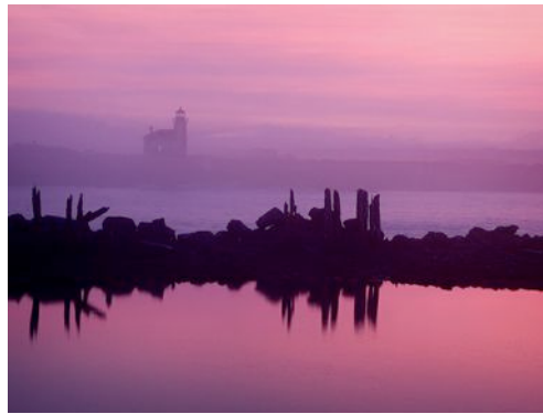
First Light Lucy Durfee