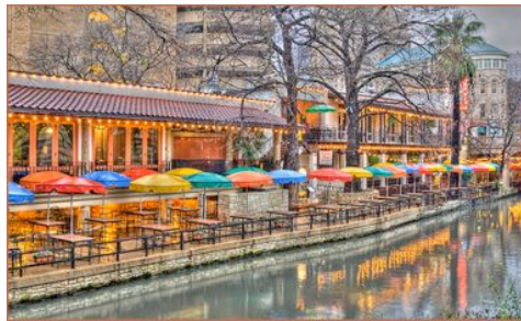
Lucy Durfee Riverwalk, San Antonio, TX