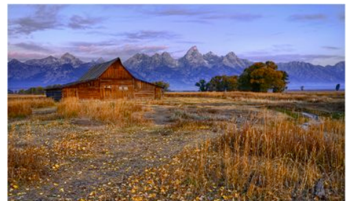
Rose Epps Moulton Barn at Sunrise