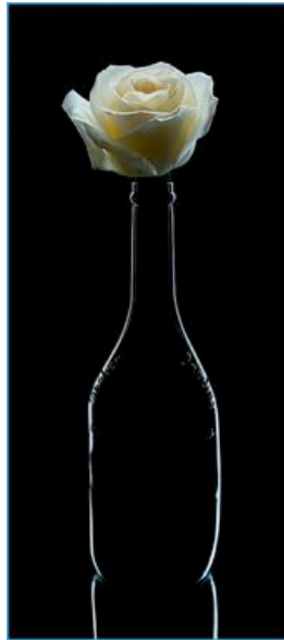
Lucy Durfee Sensual Bloom