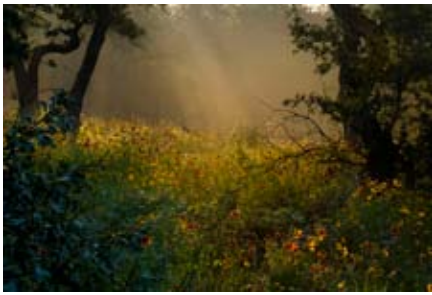
Morning Sunflowers - 15 Liz Duncan

In the Assignment category-- Texas Spring , out of 16 entries 8 received top scores: