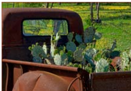
Texas Planter Box - 15 Linda Sheppard