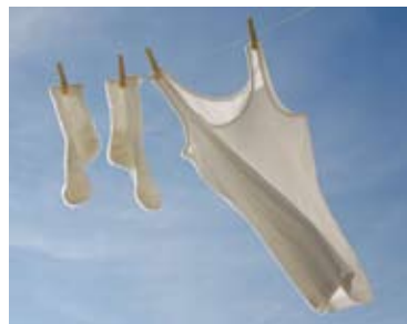
Hung Out To Dry - 14 Kathy McCall