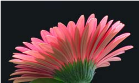
Petals of Pink - 14 Barbara Hunley

In the General category out of 20 entries 12 received top scores: