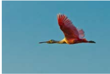
Spoonbill in Flight - 14 Beverly McCranie