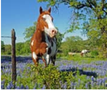
Let's Go Riding - 15 Beverly Lyle