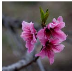
The First Sign of Spring - 14 Lois Schubert