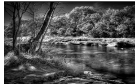
The Paluxy River at Dinosaur Valley - 14 Pete Holland