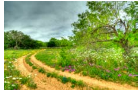
Winding Road - 15 Phil Charlton