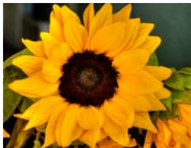
Sunflower - 14 Paul Munch