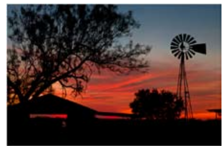
Hill Country Sunset - 14 Rose Epps