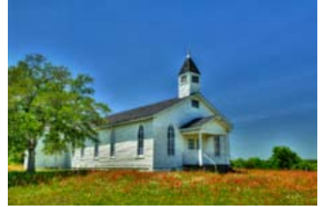
Cheapside Church - 14 Phil Charlton