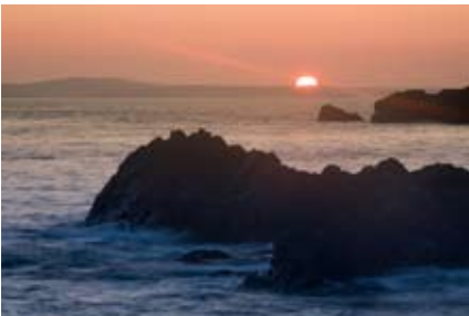
Rosario Beach - 15 Lucy Durfee