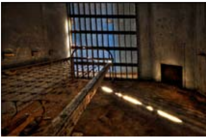
2. Jailhouse - Pete Holland