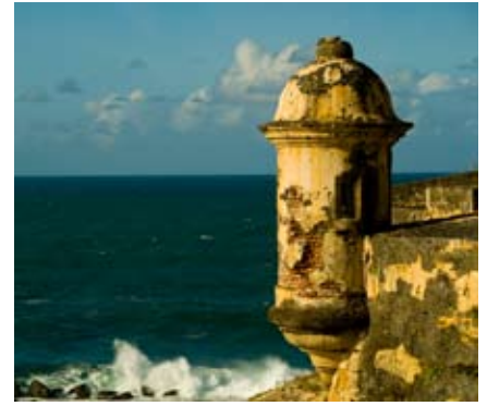
El Morro Sentry - 14 Bob Lippincott