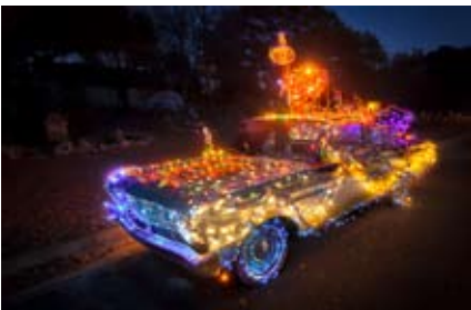
South Austin Christmas - 15 Pete Holland