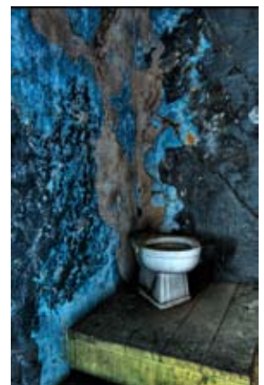
Throne Room Llano Jail - 15 Pete Holland