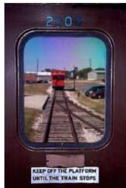
10. Be Creative - Allen Keith