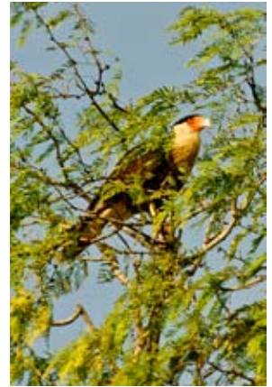
Caracara - 14 Beverly McCranie