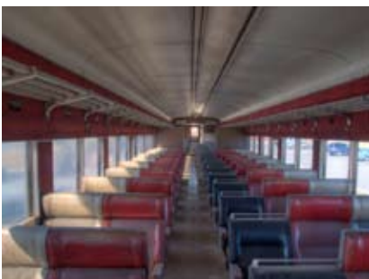
5. RR cars - Don Kirby