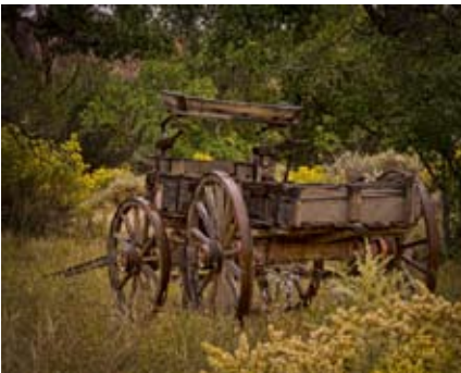
Wagon at Ghost Ranch - 15 Linda Sheppard