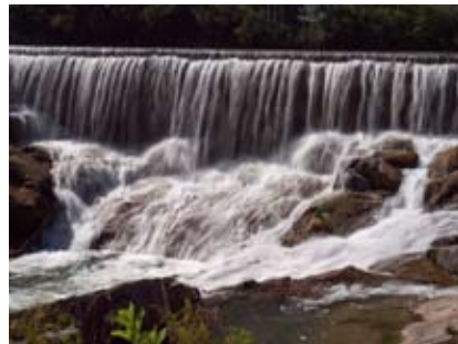
9. River - Don Kirby