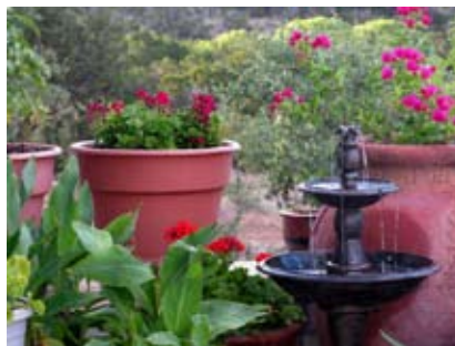
Patio Flowers and Fountain - Original