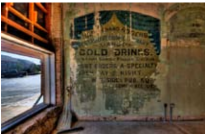
3. Historical Building - Pete Holland