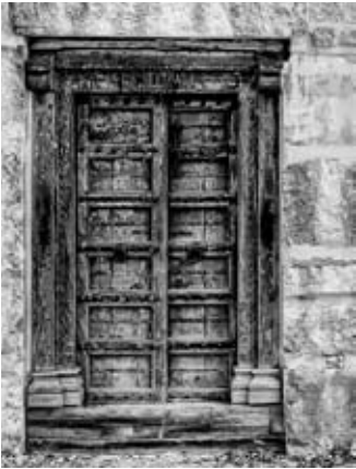
Portal - 15 Paul Munch