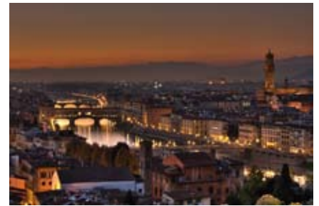
Florence at Night - 15 Lucy Durfee