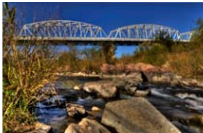
8. Llano bridge - Pete Holland