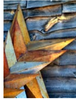
11. Metal art Paul Munch