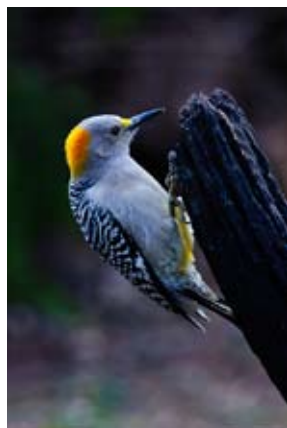
Golden Fronted Woodpecker - 15 Dolph McCranie