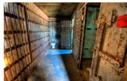
15. Best Shot of the Day Pete Holland