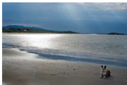
Dog at the Beach - 15 Tom Delaney

In the Assignment category, out of 5 entries 1 received a top score. The Assignment was Trailer Food