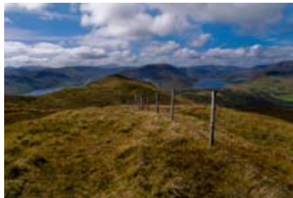
A Fence to Two Lakes - 14 Tom Delaney