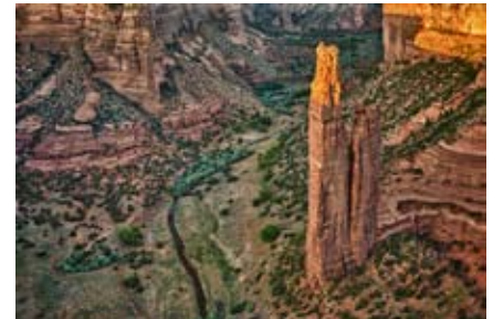
Spider Rock - 15 Rose Epps