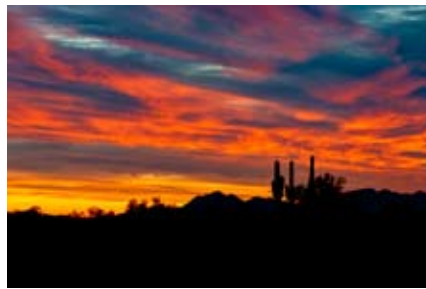
Arizona Sunset - 15 Dolph McCrainie