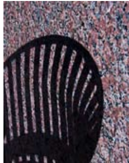
7. Granite Linda Sheppard