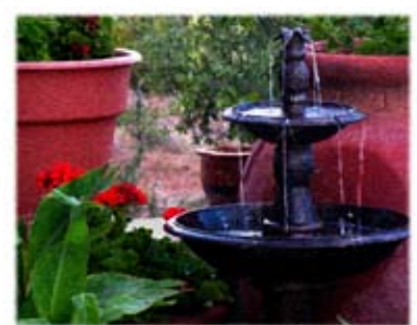
Patio Flowers and Fountain - Enhanced