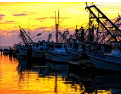
Shrimper Sunrise - 15 Paul Munch