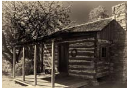
6. Log cabin - Linda Sheppard