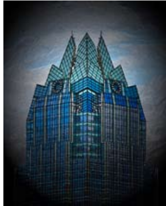
Ethereal Glow - 14 Barbara Hunley