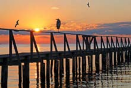
Waiting for Breakfast - 15 Beverly Lyle

In the General category, out of 31 entries 24 received top scores: