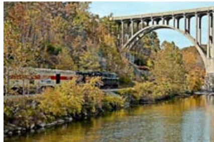
Cuyahoga Bridge - 14 Marlene Lebel