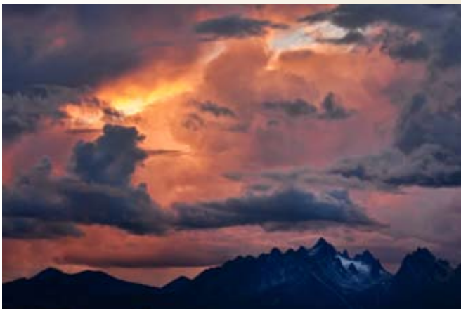
Taken about 10:00 PM from the Denali State Park Camp Ground. I more or less accidentally saw this sky with the dramatic shape of the mountains and light on the snow so was able to capture it.