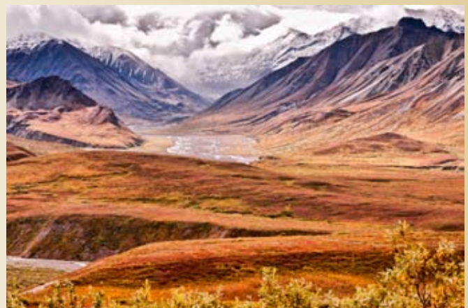
Just some of the spectacular color and scenery in the heart of Denali National Park.