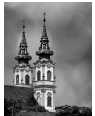
Budapest Roman Catholic Church - 15 Phil Charlton