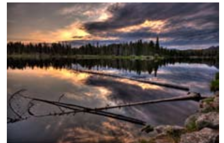
Sprague Lake Sunrise - 15 Pete Holland