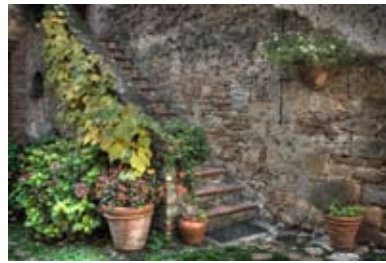
Italian Courtyard - 15 Lucy Durfee