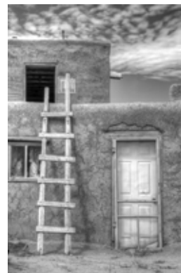
Taos Pueblo - 15 Kathy McCall