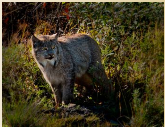
A rare catch, this lynx was sitting right beside the road and posed nicely for us as we, on the tour bus, struggled to get into position to get the shot.