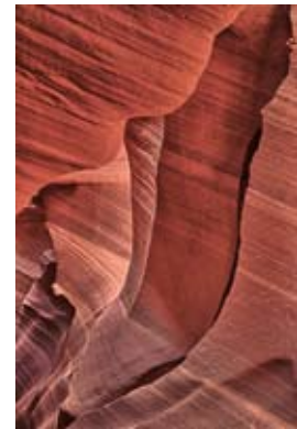
Colorful Curves, Lower Antelope Canyon - 15 Rose Epps