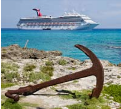
Something Old, Something New - 14 Gregg Mack