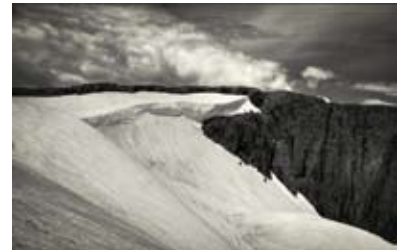
Snow Clouds - 15 Pete Holland