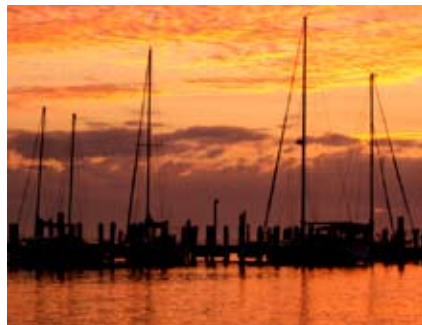
Gulf Dawn - 14 Paul Munch