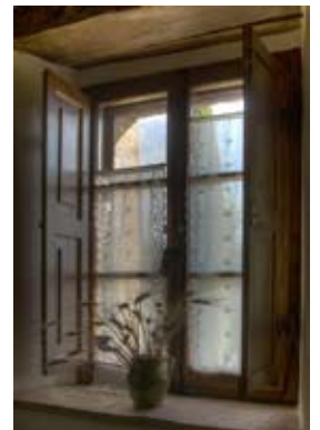
Farm House Window - 15 Lucy Durfee