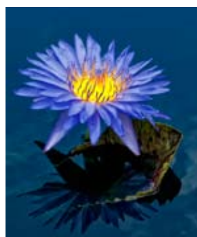
Reflections - 15 Paul Munch