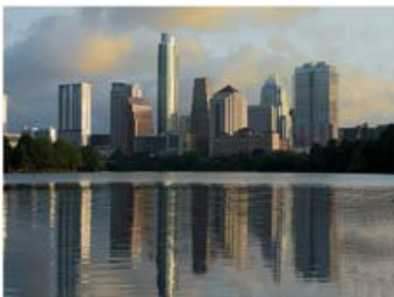
Dawn Skyline - 15