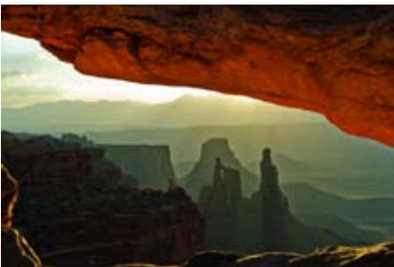
Sunrise at Mesa Arch - 15 Beverly McCranie