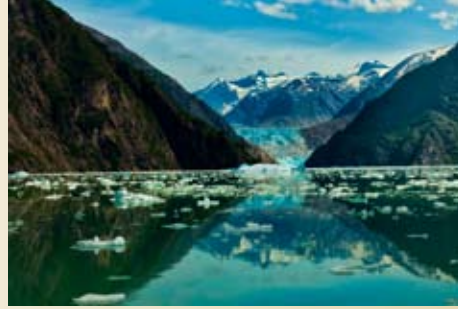
Also on the Tracy Arm Cruise this is the South Sawyer Glacier. We had already been up to that glacier and were passing back by when I was able to catch the view with the wonderful light and reflections.