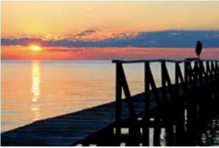
Sunrise at the Pier - 15 Beverly Lyle

In the Assignment category-- Sunrise , out of 21 entries 12 received top scores: