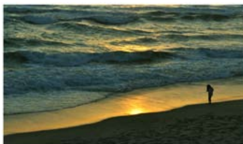
Fascinated Kid on Beach at Sunrise - 15 Raja Modugu