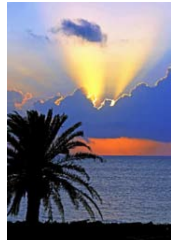
Tortilla Flats View - 15 Beverly Lyle