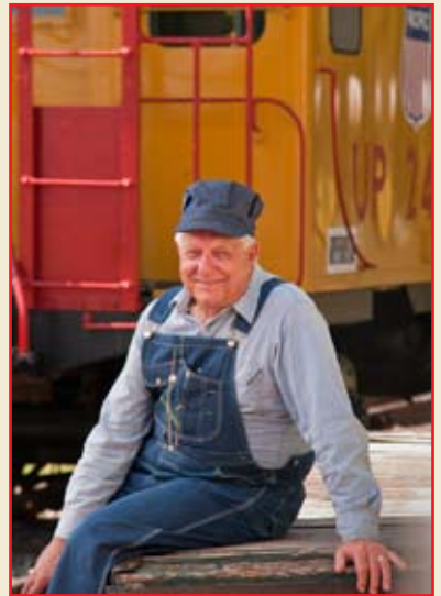
Taken at the Smithville Texas Photo Fest 2010