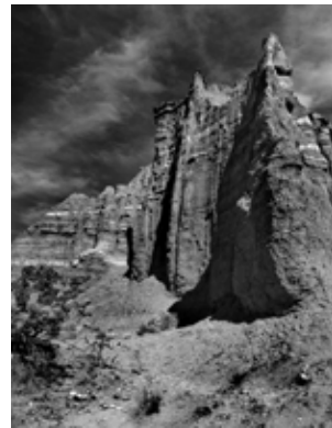
Palo Duro Ridge - 14 Tom Delaney