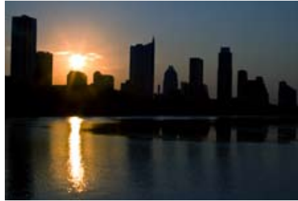
Austin Skyline at Sunrise - 14 Kushal Bose