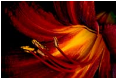
Red Lily - 15 Dolph McCranie