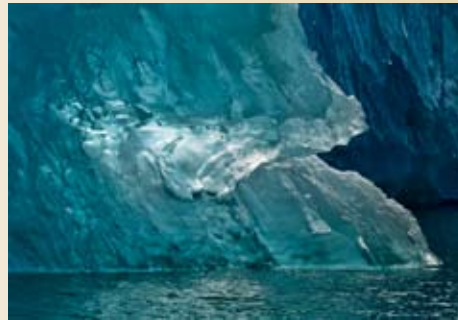
A beautiful iceberg also on the Tracy Arm Cruise.