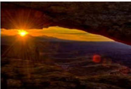
Sunrise - Mesa Arch - 15 Dolph McCranie