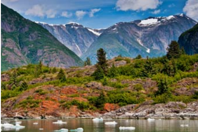
This was taken while on the Tracy Arm Day Cruise out of Juneau. I was struck by the beautiful colors as well as the lines in the scene.