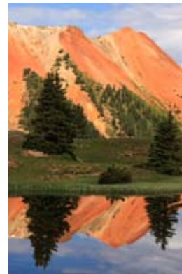
Grey Copper Gulch Reflection - 15 Teresa Devine