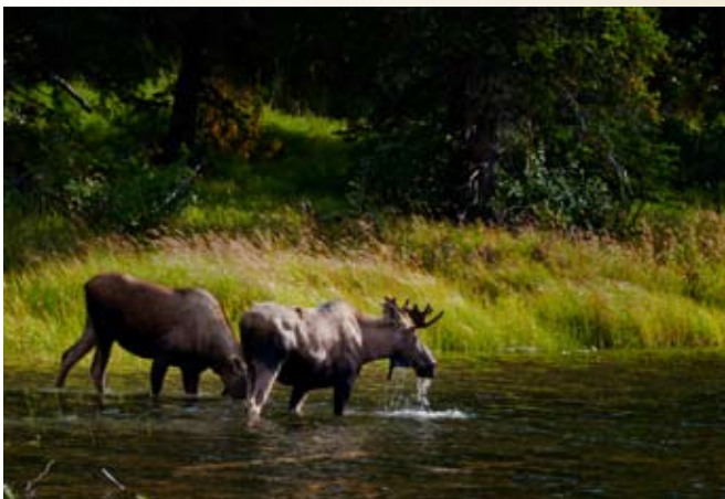
This was one of two pair of moose that we saw. These were right along the highway just before we got to Denali National Park.