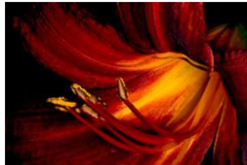
2nd Place Dolph McCranie "Red Lily"