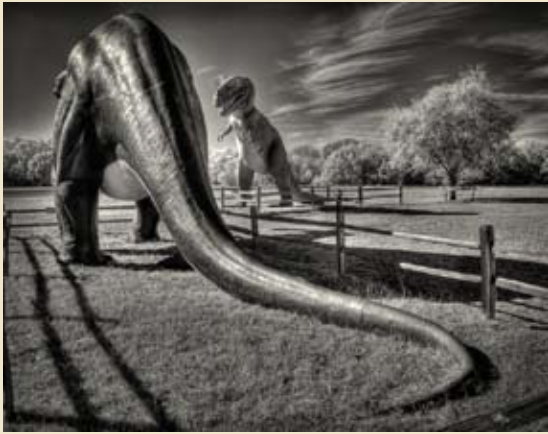
2011 Photograph of the Year Pete Holland "Dinosaurs"