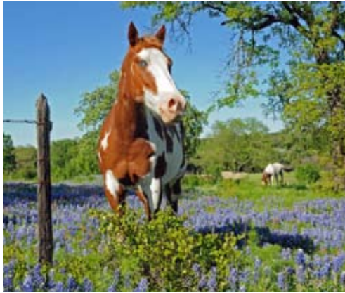
3rd Place Beverly Lyle "Let's Go Riding"

In the General category--The Winners are: